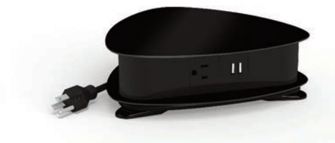
DRI-GB-108 Gloss Black Powder Coat