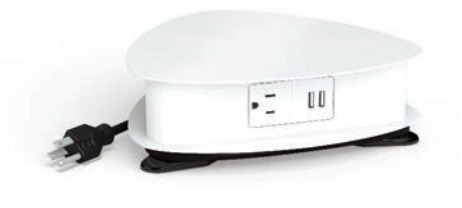
DRI-GW-108 Gloss White Powder Coat