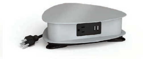
DRI-S-108 Silver Pearl Powder Coat